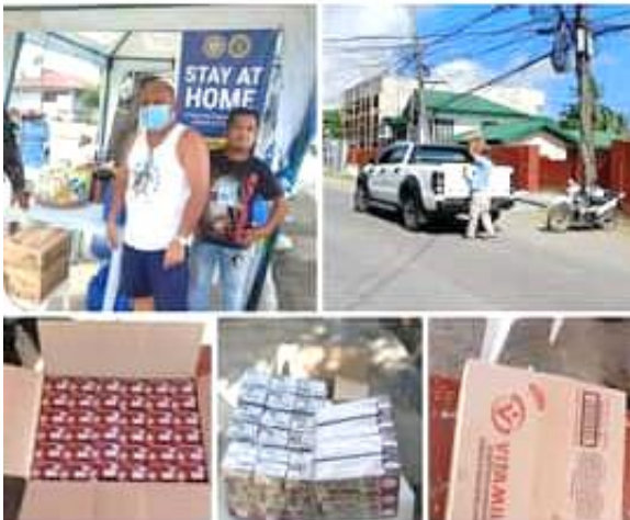
Facebook post by Kalibo Municipal Police Station